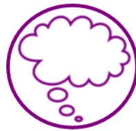
Daring to Dream