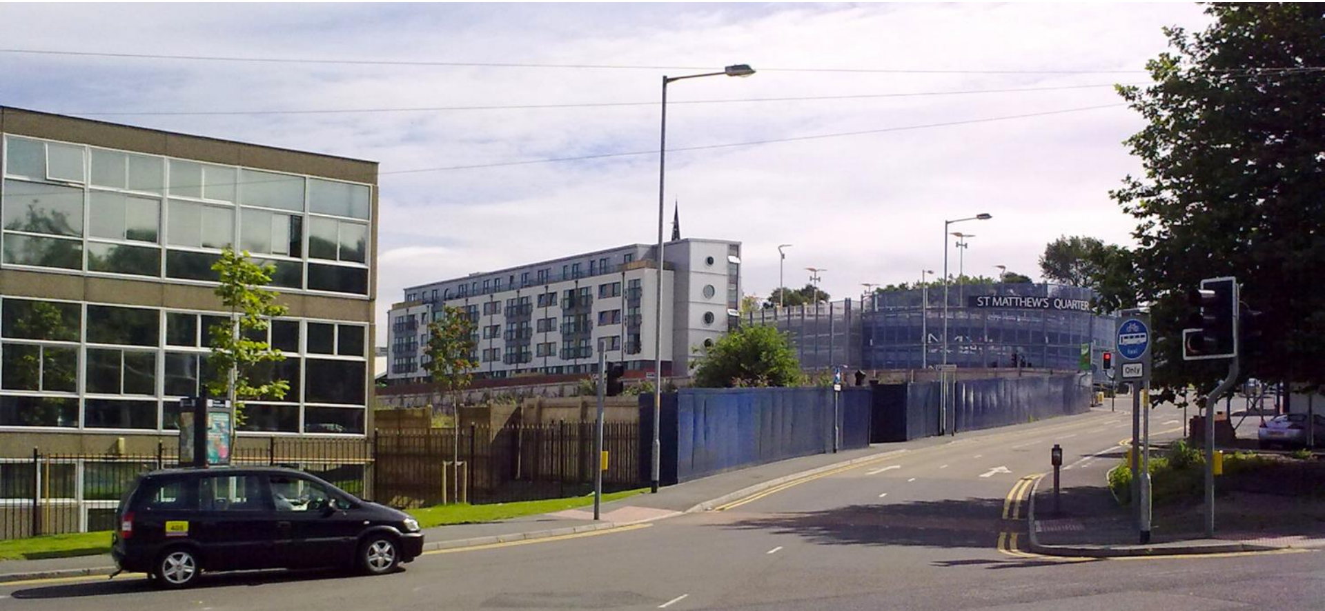
St Matthews Quarter